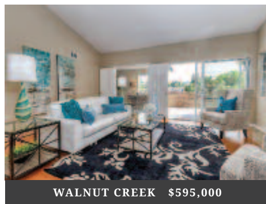
WALNUT CREEK $595,000