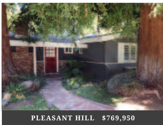
PLEASANT HILL $769,950

3320 Woodview Court | 4bd/3.5ba L. Brydon/K. Ives | 925.258.1111