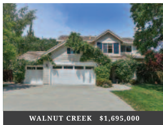
WALNUT CREEK $1,695,000

20 El Patio | 6bd/4.5ba Alan Marks | 925.258.1111